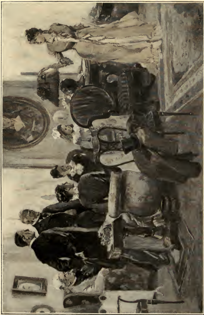
“Yes, but don't count me in , please,” exclaimed Lucy.